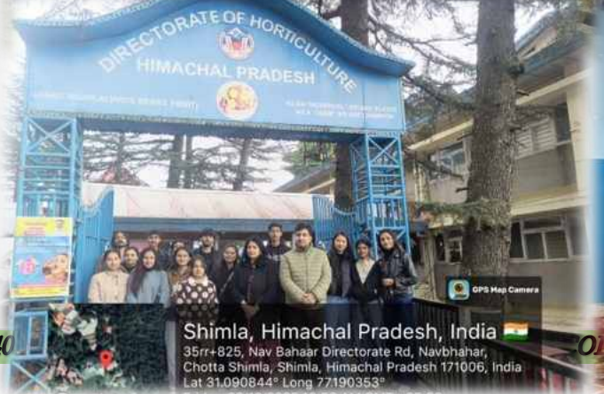
Shimla, Himachal Pradesh, India 35rr+825, Nav Bahar Directorate Rd, Navbahar, Chotta Shimla, Shimla, Himachal Pradesh 171006, India Lat 31.090844° Long 77.190353° 08/07/2025 10:56 AM GMT+05:30 Note: Captured by GPS Map Camera