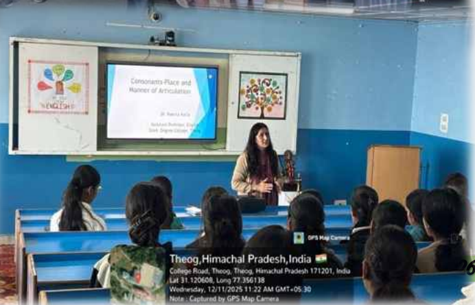
Theog, Himachal Pradesh, India College Road, Theog, Theog, Himachal Pradesh 171201, India Lat 31.120506, Long 77.356138 Wednesday, 12/11/2025 11:22 AM GMT+05:30 Note: Captured by GPS Map Camera