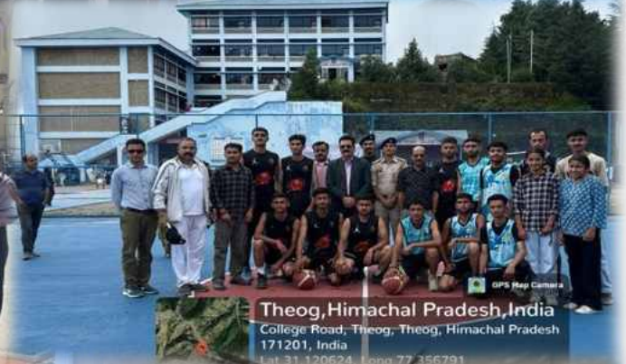
Theog, Himachal Pradesh, India College Road, Theog, Theog, Himachal Pradesh 171201, India Lat 31.120524, Long 77.356791 Note: Captured by GPS Map Camera