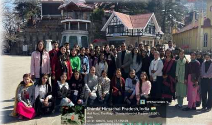
Shimla, Himachal Pradesh, India Mall Road, The Ridge, Shimla, Himachal Pradesh, 171001, India Lat 31.104695, Long 77.175109 08/07/2025 11:58 AM GMT+05:30 Note: Captured by GPS Map Camera