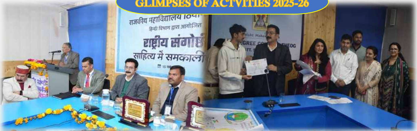
Theog, Himachal Pradesh, India College Road, Theog, Theog, Himachal Pradesh 171201, India Lat 31.120529, Long 77.35631 08/07/2025 12:21 PM GMT+05:30 Note: Captured by GPS Map Camera